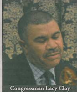
Congressman Lacy Clay

Rep. Maxine Waters (D-Calif.) said that she was concerned about much of the information