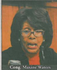
Cong. Maxine Waters

Groves defended the amounts used to purchase media ads saying they were based on statistical and historic data.